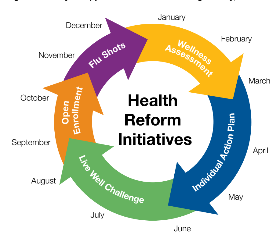
Figure D: Lifecycle Approach to Wellness in King County, Wash.

first quarter and once per quarter for the rest of the first year. Enrollees must also establish goals related to exercise or diet, with two goals per month required.