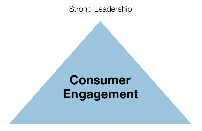
Figure B: Consumer Engagement

The importance of consumer engagement in managing health care costs is clear. An estimated 75 percent of health care costs are associated with chronic diseases,<sup>30</sup> such as diabetes and cardiovascular disease, which are linked to poor lifestyle choices.